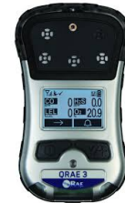
Gases Monitoring System